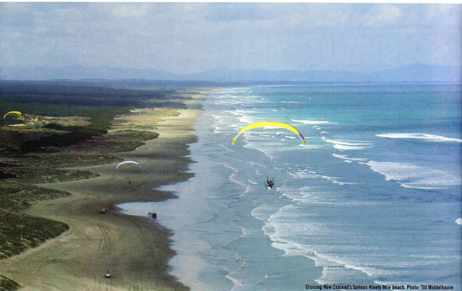
Cruising New Zealand's famous Ninety Mile beach.